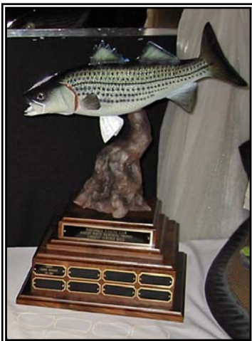
Carl Dippel Memorial Trophy (Service Award) Winner To Be Announced at Dinner