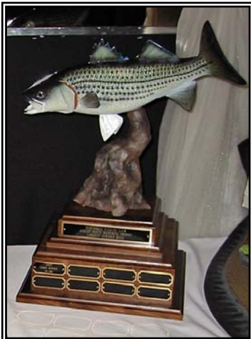
Carl Dippel Memorial Trophy (Service Award) Winner To Be Announced at Dinner