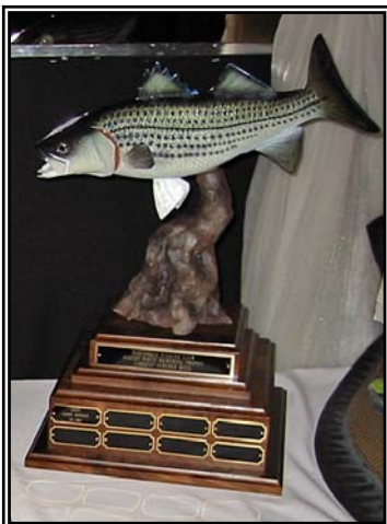
Carl Dippel Memorial Trophy (Service Award) Winner To Be Announced at Dinner